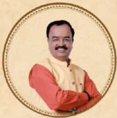
SHRI KESHAV PRASAD MAURYA HON'BLE DEPUTY CHIEF MINISTER GOVERNMENT OF UTTAR PRADESH