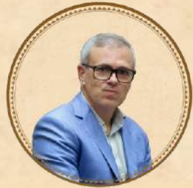
SHRI OMAR ABDULLAH HON'BLE CHIEF MINISTER OF JAMMU AND KASHMIR