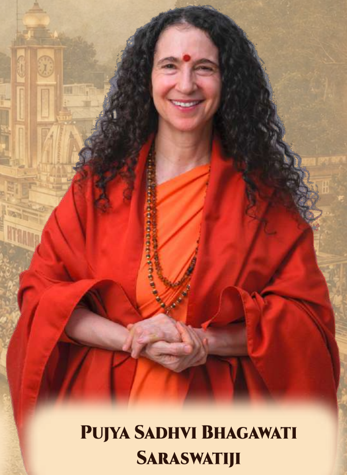
PUJYA SADHVI BHAGAWATI SARASWATIJI