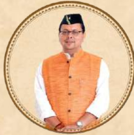
SHRI PUSHKAR SINGH DHAMI HON'BLE CHIEF MINISTER OF UTTARAKHAND