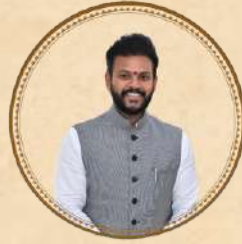
SHRI KINJARAPU RAMMOHAN NAIDU HON'BLE MINISTER OF CIVIL AVIATION, GOVERNMENT OF INDIA