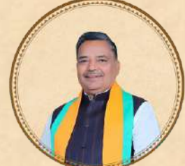
SHRI JAIVEER SINGH HON'BLE MINISTER OF TOURISM & CULTURE GOVERNMENT OF UTTAR PRADESH