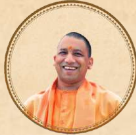
SHRI YOGI ADITYANATH HON'BLE CHIEF MINISTER OF UTTAR PRADESH