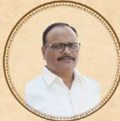
SHRI BRAJESH PATHAK HON'BLE DEPUTY CHIEF MINISTER GOVERNMENT OF UTTAR PRADESH