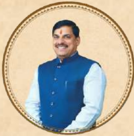
DR. MOHAN YADAV HON'BLE CHIEF MINISTER OF MADHYA PRADESH