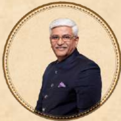
SHRI GAJENDRA SINGH SHEKHAWAT HON'BLE MINISTER OF TOURISM & CULTURE, GOVERNMENT OF INDIA